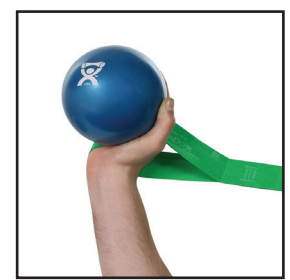
add resistance to specific activity