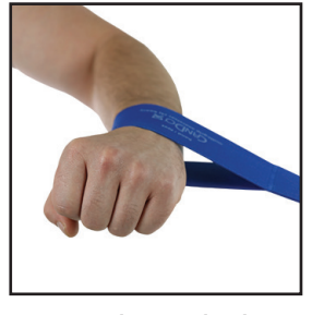
no grip required