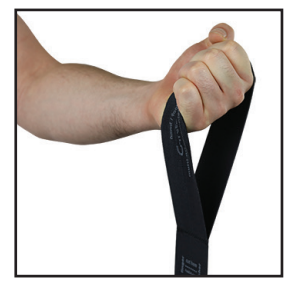
active closed grip