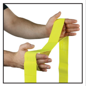
passive open grip